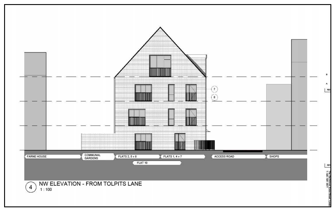
Elevation to Tolpits Lane

The design of the elevations is restrained but with a strong vertical rhythm in the fenestration on all elevations to give a modern appearance that complements the surrounding buildings. The proposed materials are brown facing brick and grey concrete roof tiles with white windows, which compliment the variety of materials found in the locality.