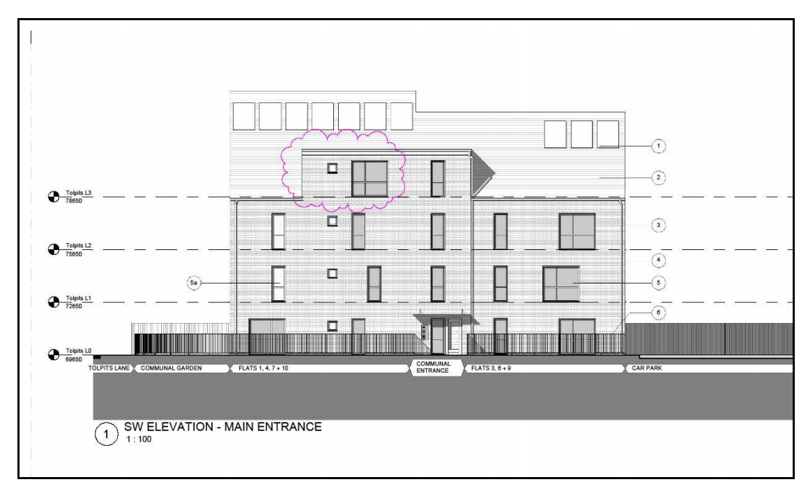
South west elevation

Westfield Academy, 3 storey blocks of flats, two church halls, a specialist school, a support centre and the adjacent local shopping parade. The age, design and materials of these buildings is equally varied and there is no predominant or consistent building style in evidence, although brick is the most common material. In this context, the proposed 3 storey building in facing brick with contemporary design will complement the range of buildings within the street. Overall, it is considered the building will enhance the street scene and be a positive addition to the local area.